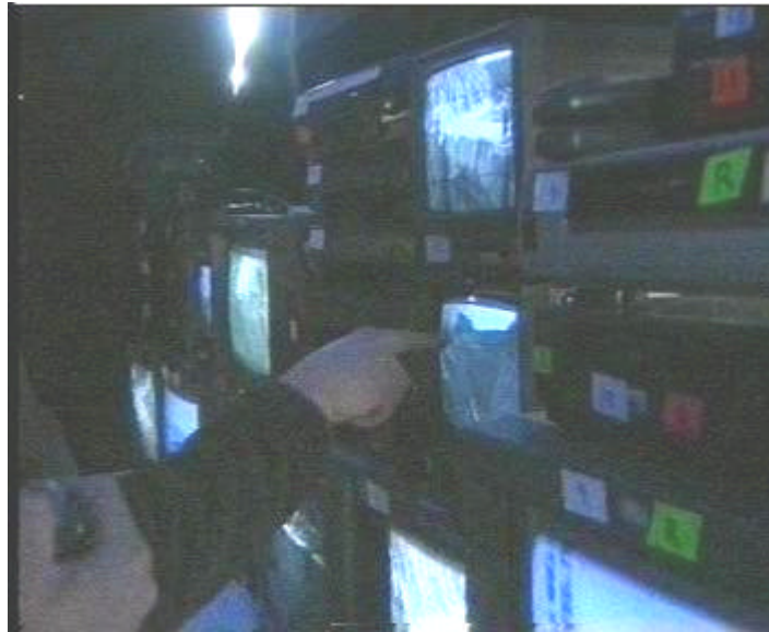
Figure 4: Camera control screens on the set of Dante's Peak (1996)

Two types of objects enter into a physical special effects' arrangement: the objects that constitute the basis for machines can normally be dis-assembled, while others objects like consumables are often dispersed in the context of the arrangement-in-action. Machines are assembled on the basis of elements from the repertoire returning to the repertoire (with signs of usage and wear), whereas models are very often physically destroyed (through explosion, crash, etc.), which introduces a strong notion of uniqueness and irreversibility for many of the effects represented in our material.