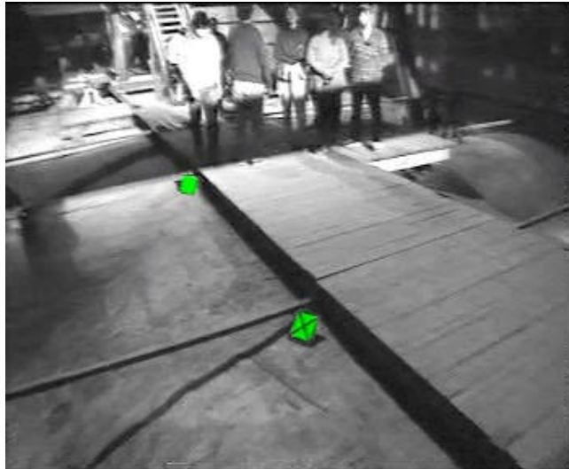
Figure 10: Markers set on the set of Vidocq (2002) to facilitate post production