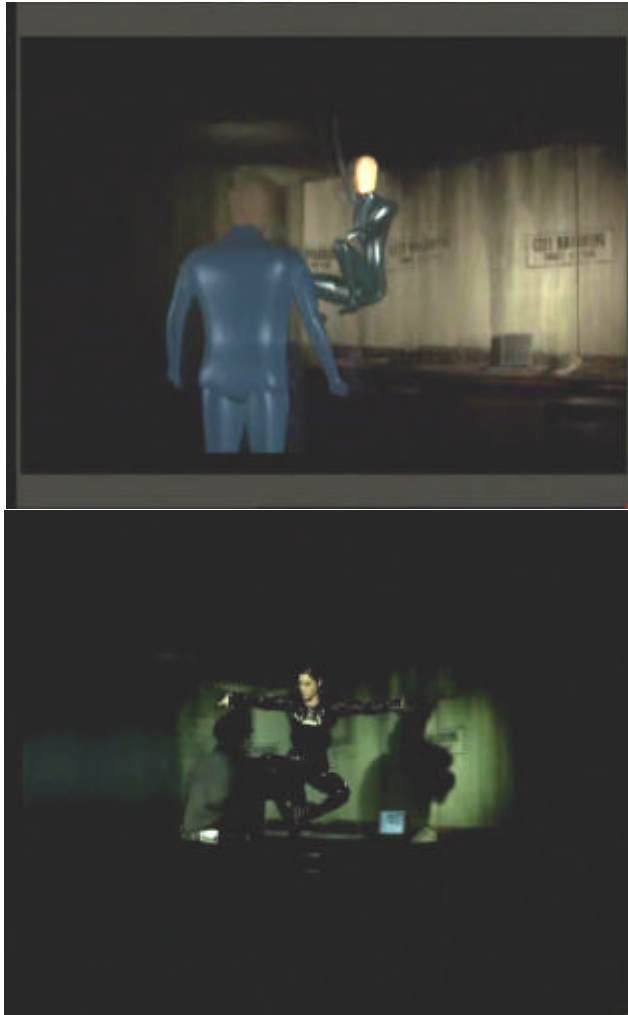
Figure 8: Virtual scene with incrustation of actor in Matrix (1999)