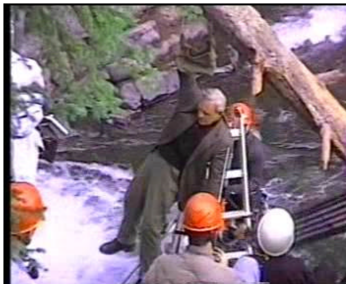
Figure 5: Actor Anthony Hopkins in a special effects arrangement in The Edge (1997)

Constraints for making physical special effects are much related to the physical environment in which the effect is to be put into action, and to the necessity to physically displace objects and arrangements. The materiality of the elements entering into construction creates a situation in which the re-production of an arrangement is almost as costly in terms of energy, time, and money, than the initial arrangement produced. In other words: the absence in physical arrangements of "copy" and "undo" represents a major constraint physical special effects makers have to take into account. Another type of constraint lies in the fact that an arrangement very often brings movie actors in direct contact with the objects used to produce the effect (cf. figure 5). The physical effects maker has to be ensured that no one on the movie set is being fragilized through the arrangement.