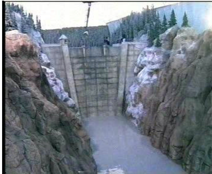
Figure 2: Model of dam (scale 1:3) for Dante's Peak (1996)

The objects in the repertoire are heterogeneous both in terms of material and in degree of complexity. There seems to be one set of objects that forms the core of the repertoire and the material "capital" of a special effects firm. This material repertoire is coherent with the effect makers' experience base. Other, additional objects can be brought in more occasionally depending on a concrete project. In this sense, the repertoire of the physical special effects maker is not an entirely closed universe as in Lévi-Strauss's view of bricolage , but composed of a central physical space comprising a core set of objects (often used to assemble machines that are dis-assembled after the project) and several concentric zones of access to complementing objects that are activated for particular projects. It seems to us that networks of effect makers and suppliers of requisites, etc. play an important role in the making of a physical special effect. In this sense, the physical repertoire itself could be seen as being organized along networks.