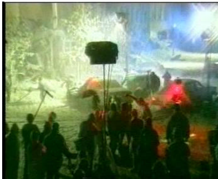
Figure 1: Dispersion of "volcanic ashes" (newsprint) on the set of Dante's Peak (1996)

The making of physical effects involves a repertoire of physical objects in a delimited physical space (Matarasso, 2002). This repertoire is constituted depending of the particular kind of effects or environment the effects makers focus on. Some specialize in modeling, while others, for example, develop particular competencies in effect making in hostile natural environments (e.g. high altitude). Despite specialization the variety of arrangements assembled by physical special effect makers is high ("never two times the same thing" Matarasso, 2002; translation by the authors). This demands a high versatility and connectivity of the objects in the repertoire as well as a thorough knowledge about the potential utilizations that can be attributed to an object.