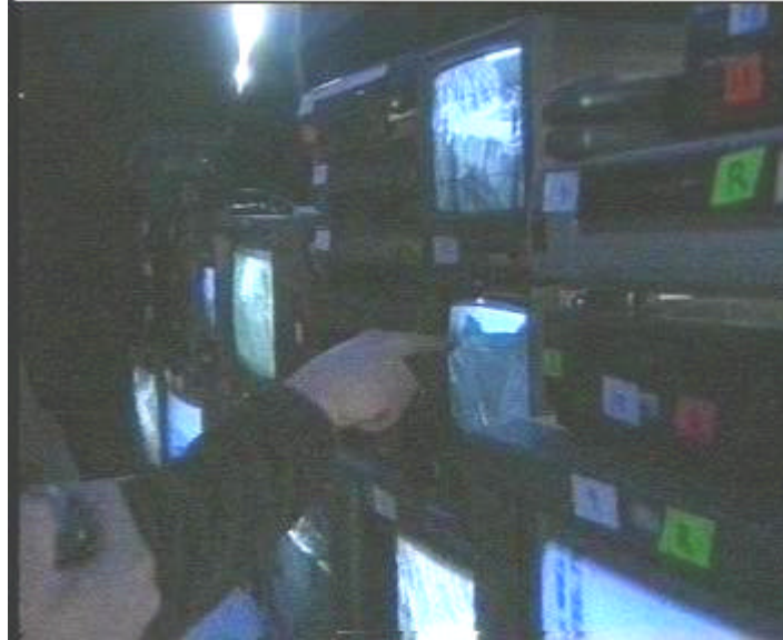
Figure 4: Camera control screens on the set of Dante's Peak (1996)

Two types of objects enter into a physical special effects' arrangement: the objects that constitute the basis for machines can normally be dis-assembled, while others objects like consumables are often dispersed in the context of the arrangement-in-action. Machines are assembled on the basis of elements from the repertoire returning to the repertoire (with signs of usage and wear), whereas models are very often physically destroyed (through explosion, crash, etc.), which introduces a strong notion of uniqueness and irreversibility for many of the effects represented in our material.