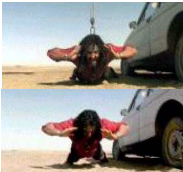
Figure 9: Complementarity of physical and digital effects in Le Boulet (2002)