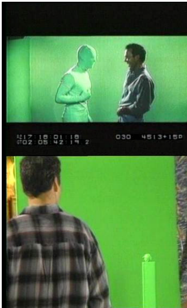
Figure 11: Physical objects on the set of Multiplicity (1996)