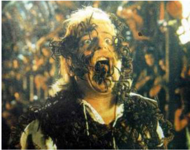
Figure 6: Digital effect in French movie Asterix et Obélix contre César (1998)