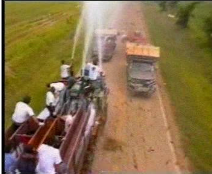
Figure 3: Creating an illusion of driving in a hurricane for Twister (1996)

Moreover, most physical effects demand the embedding of objects in a physical environment which itself does not belong to repertoire and is not under control of the effect maker. In consequence, the heterogeneous objects from the repertoire do not only have to hold among themselves, but they have also to go together with the physical environment in which the effect arrangement is situated in.