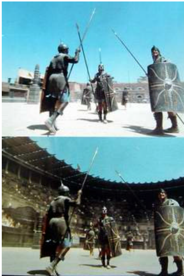
Figure 7: Digital adding of scenery (matte painting) in Gladiator (1999)